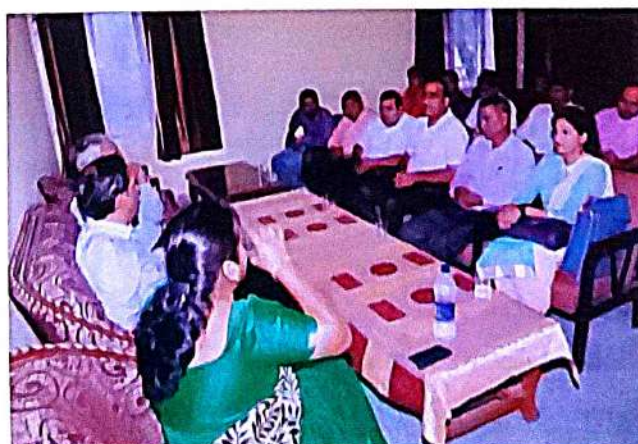
NAAC Team interacting with members of PTA & O.S.A.