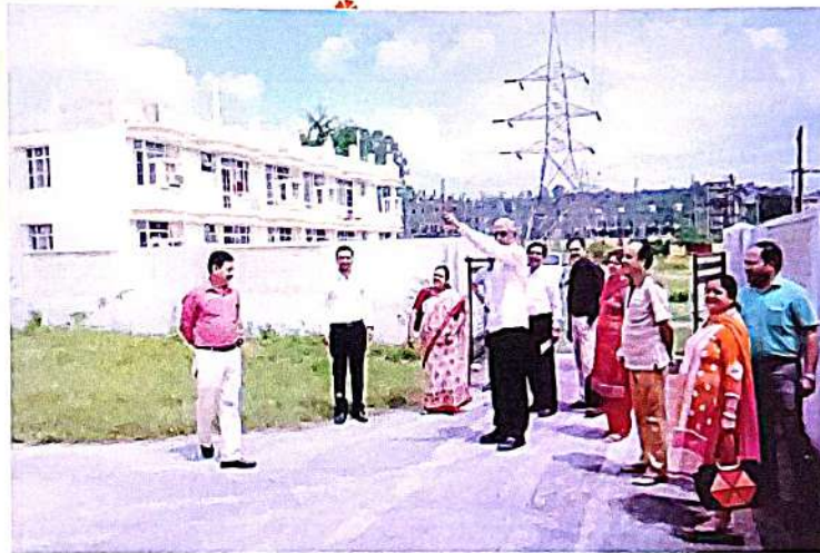
A visit to the staff - quarters by NAAC Peer Team