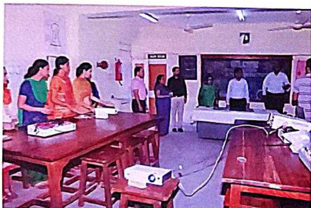
Inspection of Physics Laboratory by NAAC Team