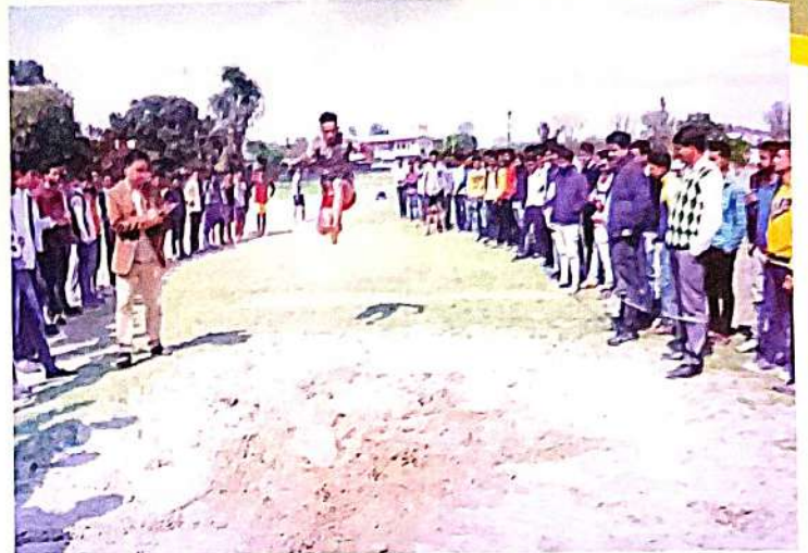
Long Jump in Action