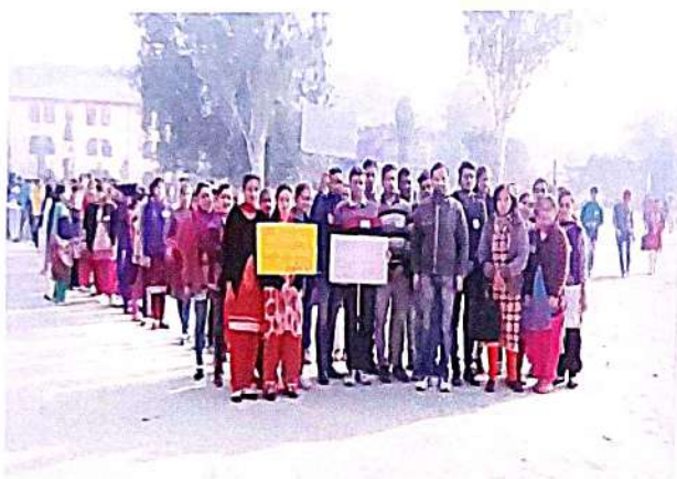
Rally on Clean India Green India by NSS Volunteers