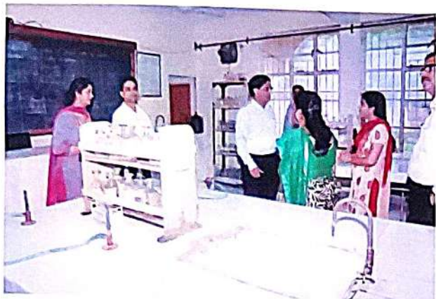
NAAC Team In Chemistry Laboratory ❀