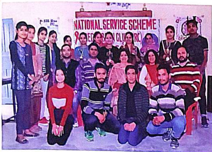
Participants of Slogan Writing & Poster Making Competition in a group photograph with the Principal