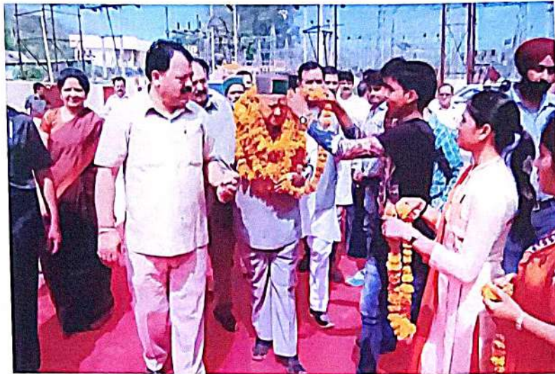
Hon'ble Chief Minister, Sh. Virbhadra Singh Ji being welcomed & garlanded by the students of the college