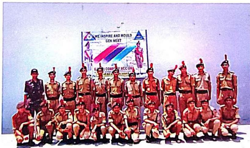
NCC Cadets of College Attending Camp at Pekhubela , Una