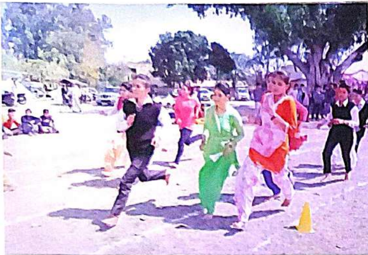
Girls participating in 100 m race