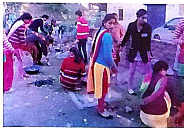
N.S.S. volunteers cleaning the campus of Devi Mandir Amb.