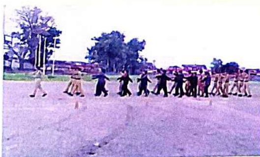
Parade by NCC students on Annual Athletic Meet