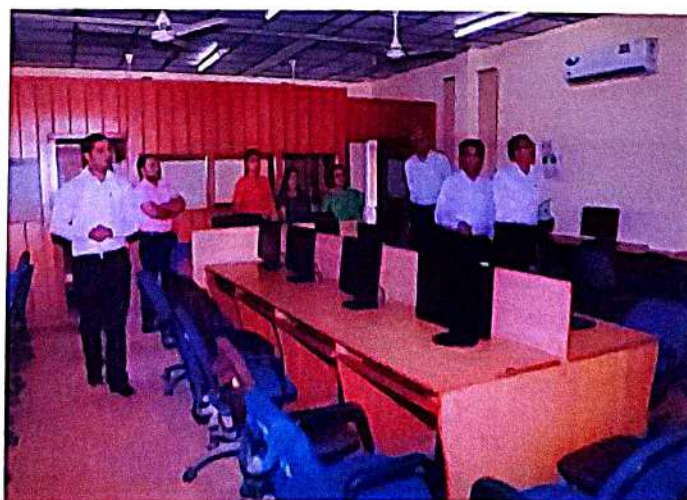
Inspection of Computer Laboratory by NAAC Peer Team