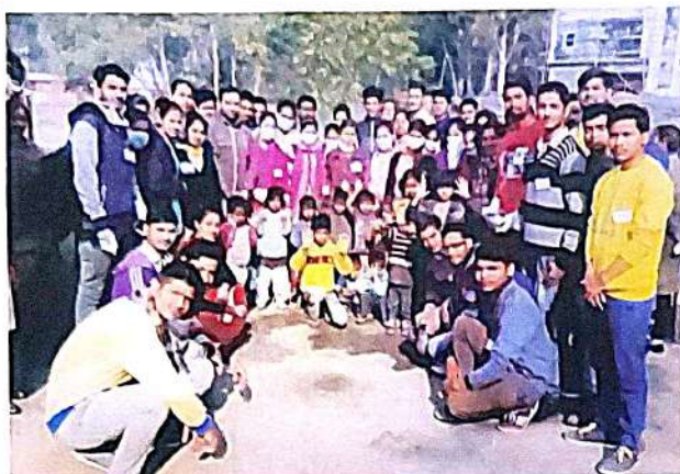
N.S.S. volunteers on a cleanliness campaign to the slums