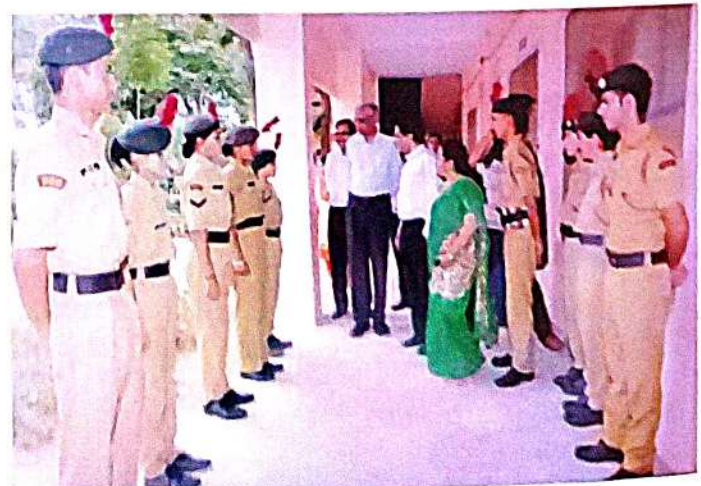
N.C.C. Students welcoming the NAAC team, in the N.C.C. Room