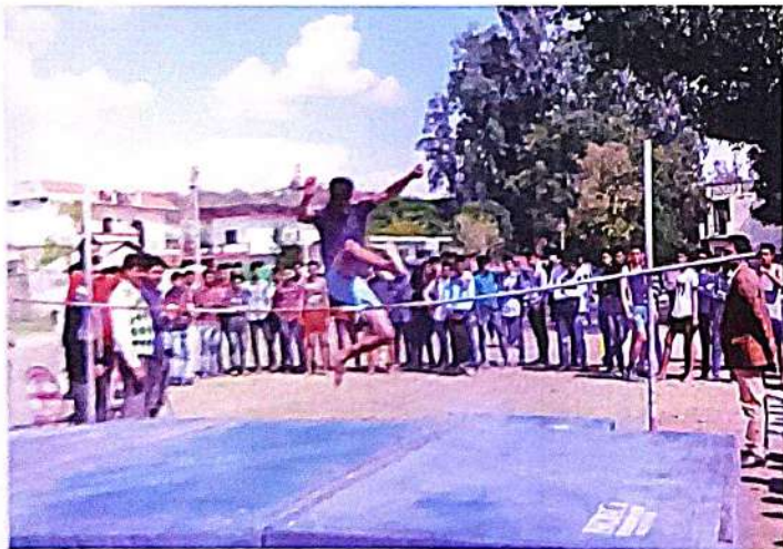
High Jump in Action