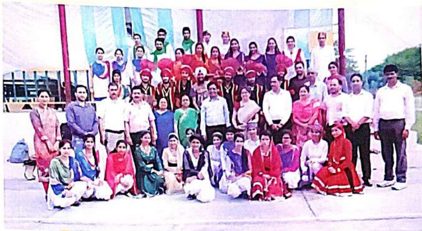
NAAC Team with participants of Cultural items