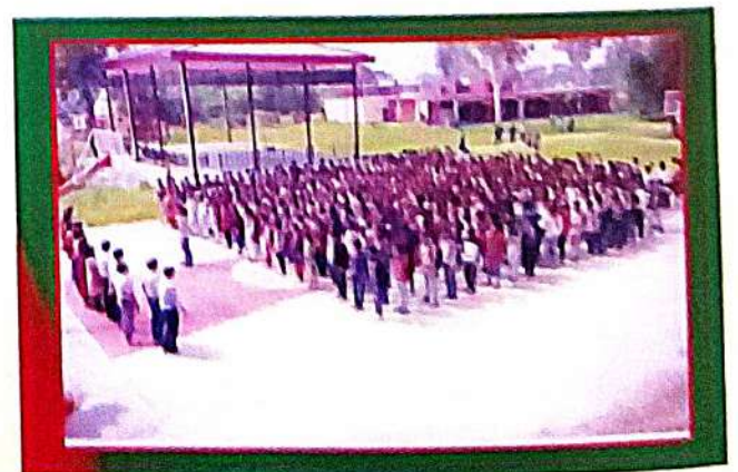
A View of students during National Anthem on 23rd August, 2016