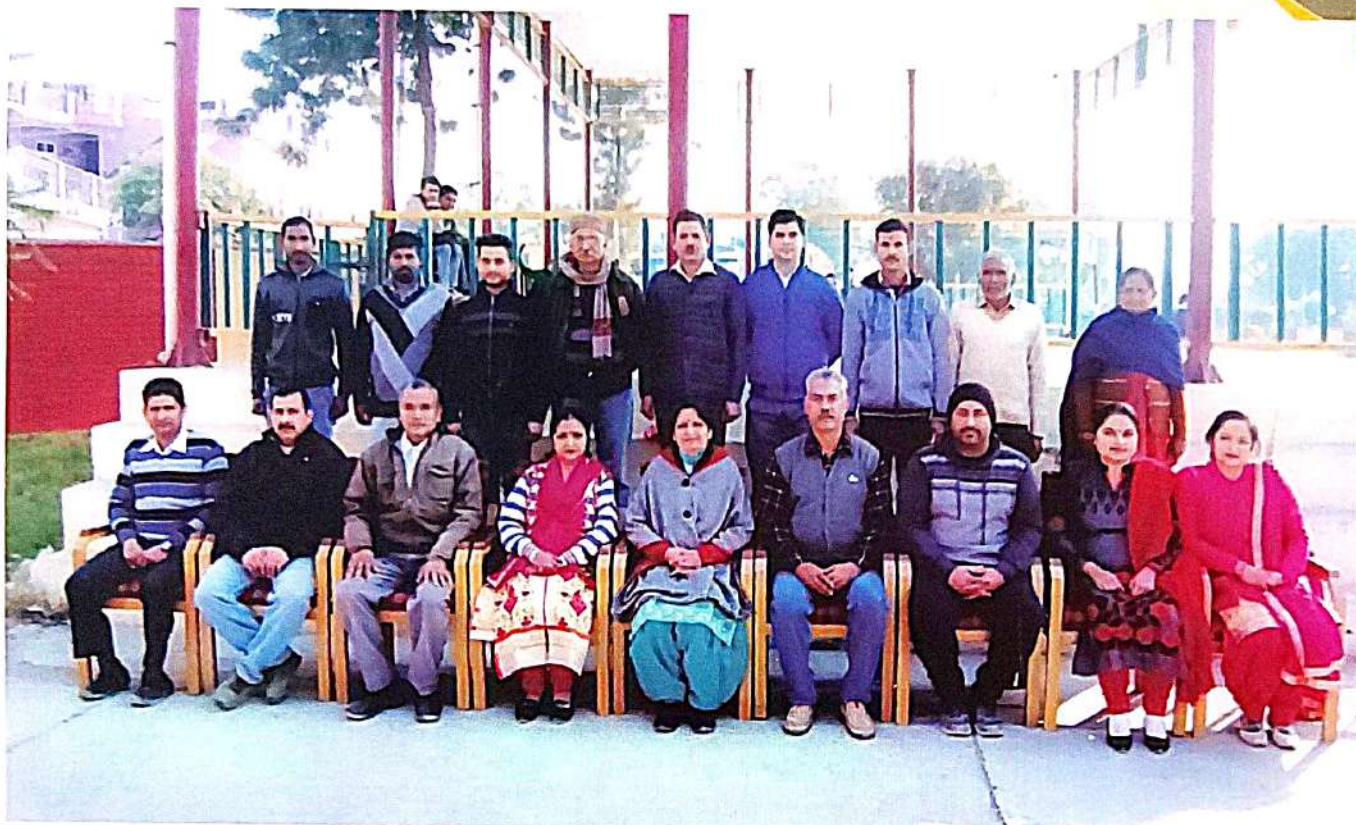
Principal with members of Non-Teaching Staff