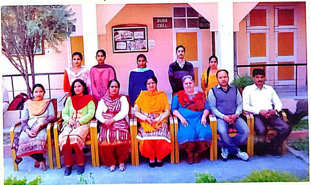
Principal with Editorial Board