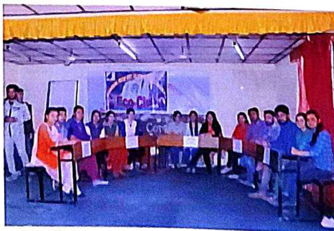
Quiz competition on " Environment"