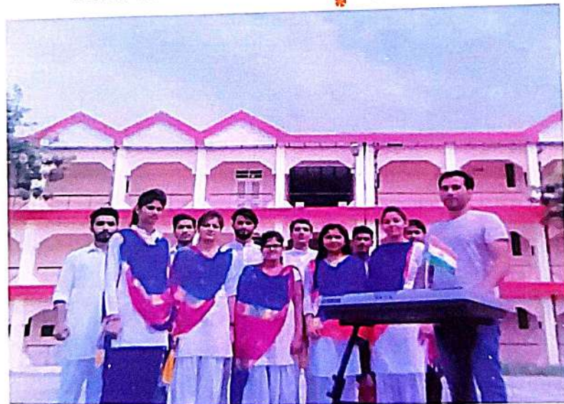
Celebration of Independence Day