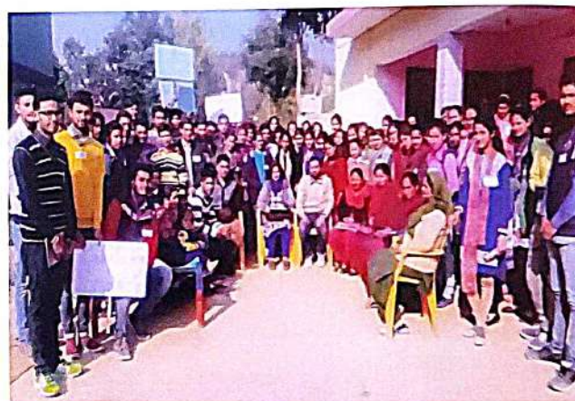
NSS Volunteers Making the Localities aware about "Cashless Transaction"