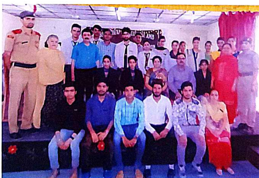
CSCA Office bearers with the Principal