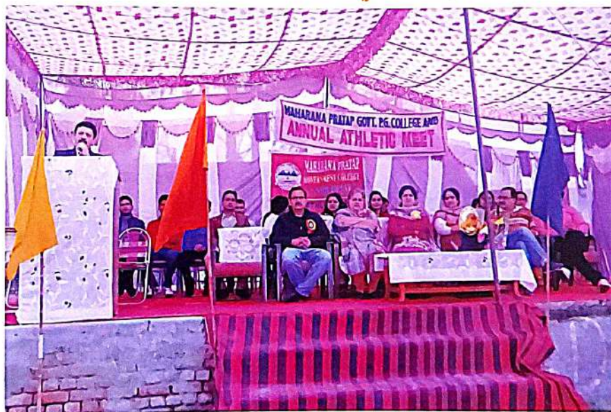
Principal and other staff members watching various activities on Annual Athletic Meet.