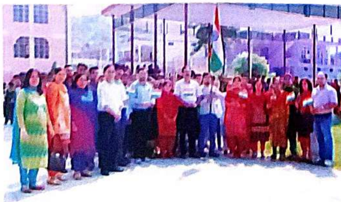
Tiranga March on 22nd August, 2016