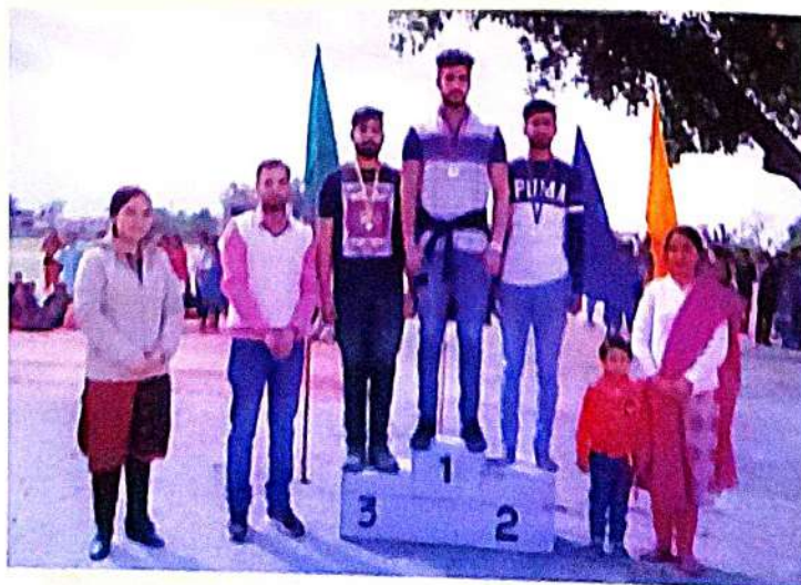
Prize Winners on Podium