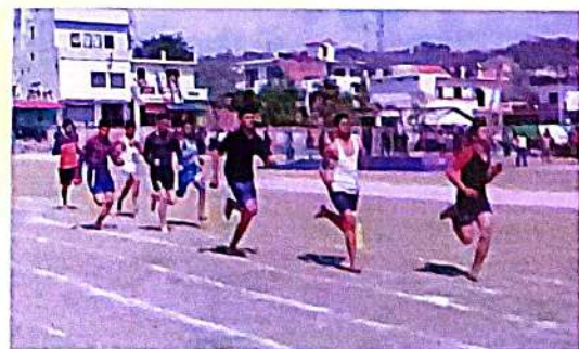
Students participating in 1500m. race