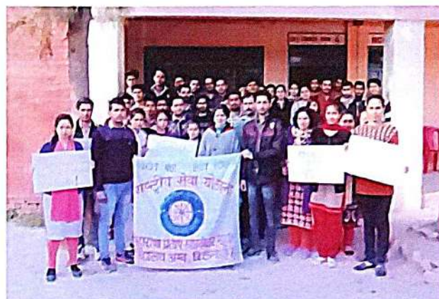
"Awareness on Voting" by N.S.S. Volunteers