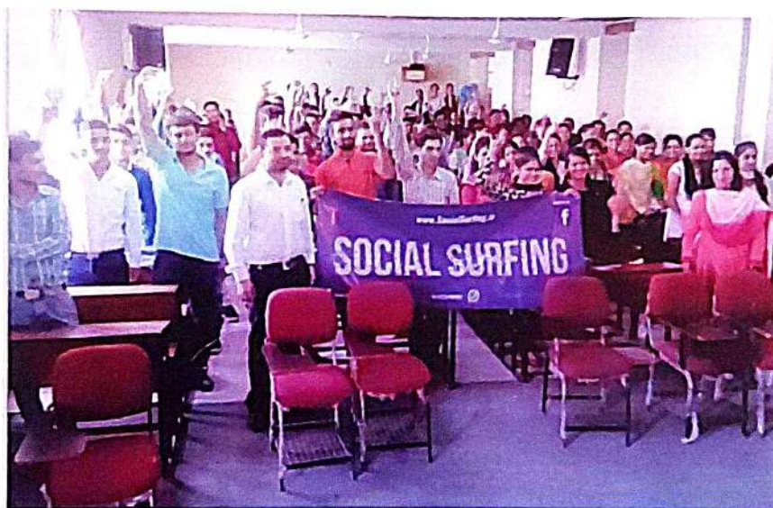
Workshop on Social Surfing