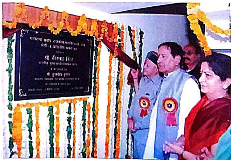
Hon'ble C.M. inaugurating the newly constructed staff quarters of College Colony