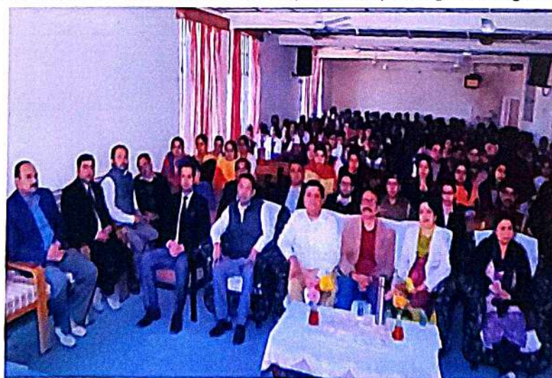
Audience Listening attentively to the speaker in workshop on "Drug Abuse & Laws pertaining to Drugs"