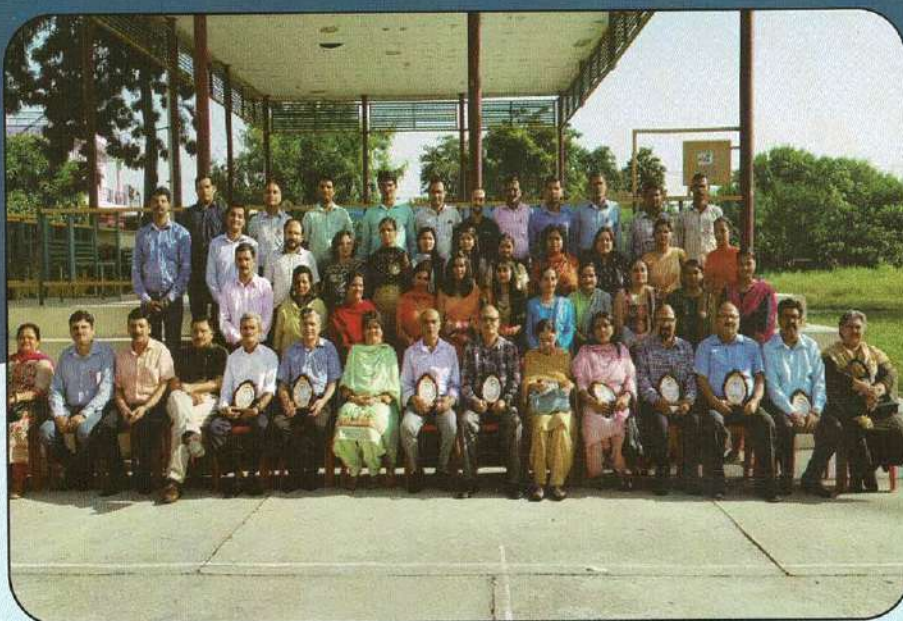
Elders experience meets youngsters enthusiasm (Meeting of retirees with college staff members)