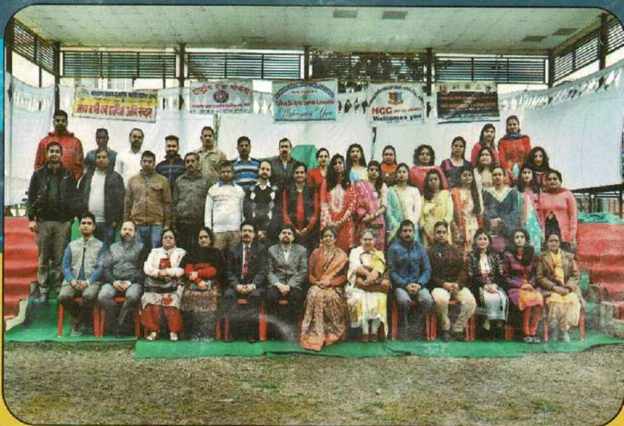
Principal & Staff of the College