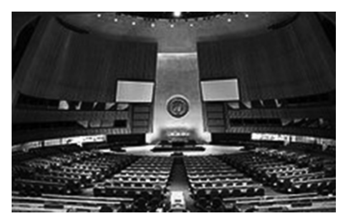
Fig. 4.2 The General Assembly

The General Assembly (Figure 4.2) is the major deliberative assembly of the United Nations. It comprises of all the United Nations' member states. The assembly meets in regular annual sessions under a president elected from among the member nations. Over a two-week period at the beginning of each session, all members have the chance to address the assembly. Usually, the Secretary-General makes the initial statement, followed by the president of the assembly. The first session was convened on 10 January 1946 in the Westminster Central Hall in London and incorporated representatives of fifty-one nations. When the General Assembly votes on significant questions, a two-thirds majority of those present and voting is needed.