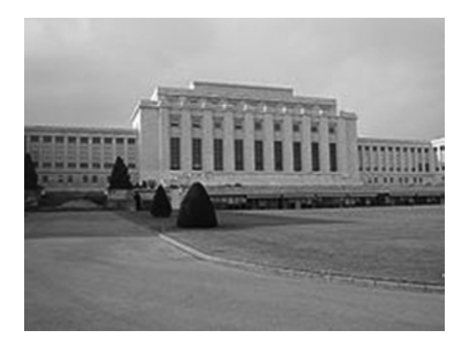
Fig. 4.1 Palace of Nations, Geneva, the League's Headquarters from 1929 until its Dissolution