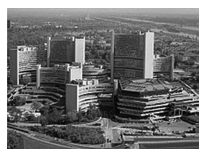
Fig. 4.3 UN Building in Vienna