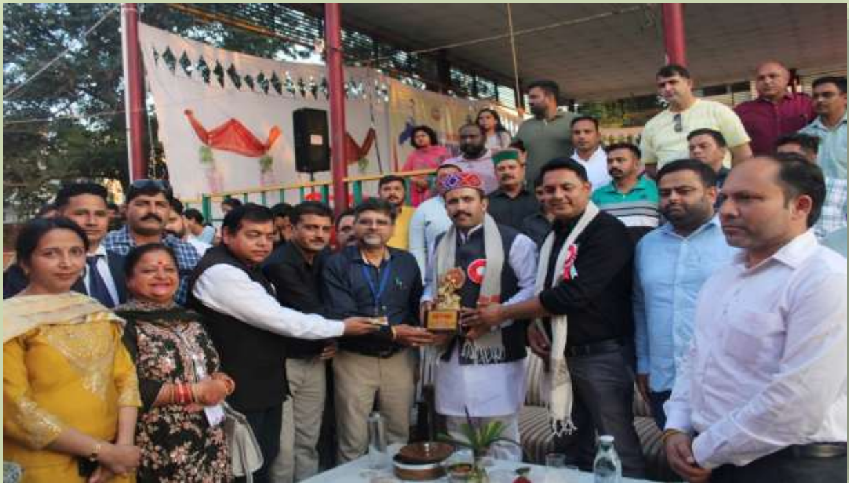
Glimpses of Annual Function