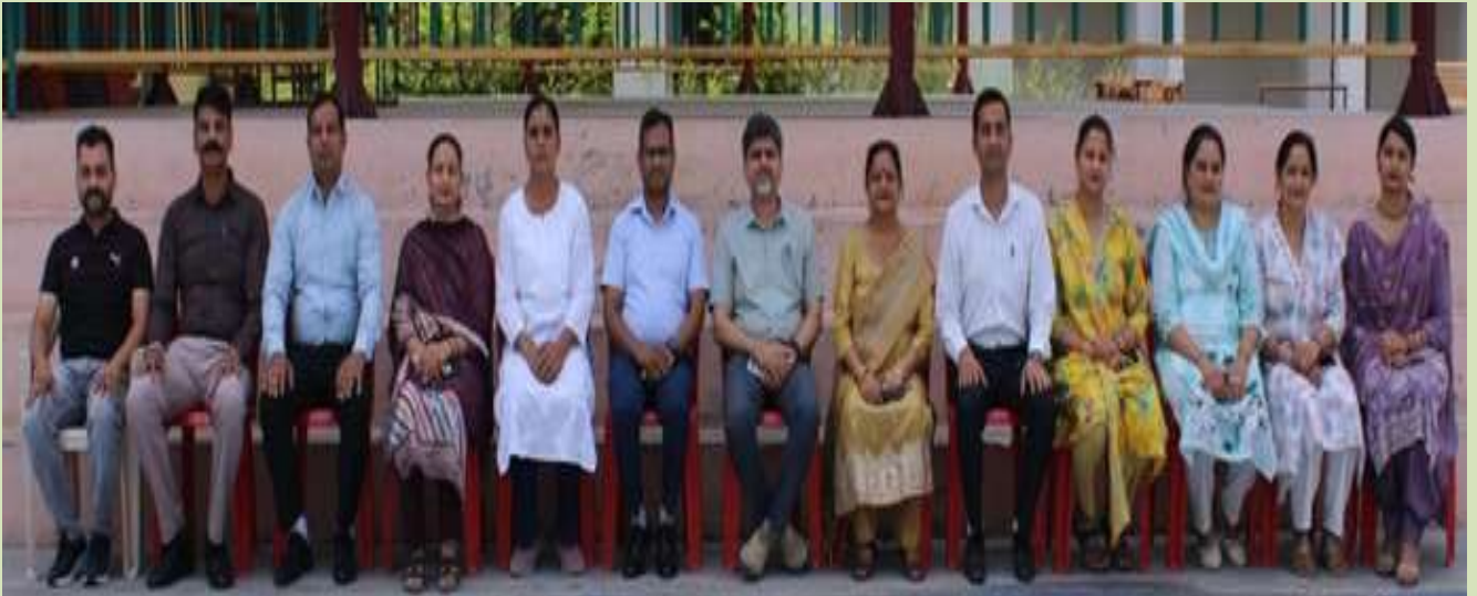
Teaching Staff & Non-Teaching Staff